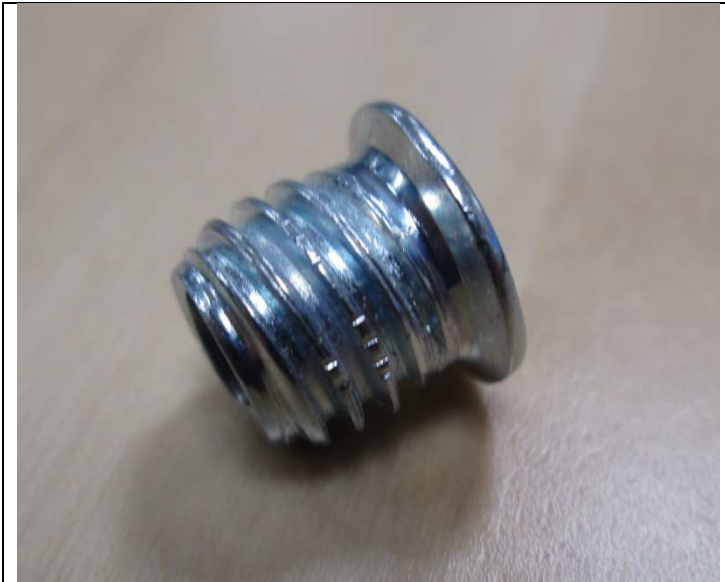
Item number 12.10.256